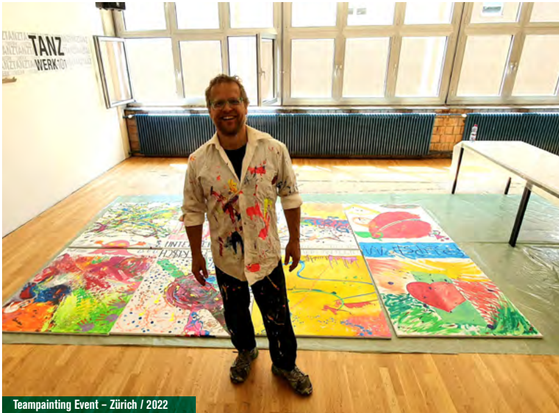
Teampainting Event – Zürich / 2022